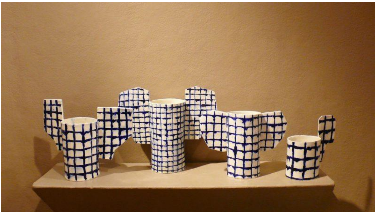
Alex Stadler, Winged Victories.

Building his ceramics in white porcelain glazed with cobalt-blue decoration, Stadler revisits and reinvigorates a color combination beloved for centuries in the East, West—nearly everywhere. By adding flat, wing-like appendages to columnar vases, he conjures the Winged Victory of Samothrace created in Greece around 200 BCE. In "Warrior Queens," Stadler saw a head after joining two bowls to form a ball; handles become ears and a straight, flat projecting arc of porcelain on top read as a fierce mohawk from one angle and a dramatic headpiece from the other. The piece suggests pre-modern objects while addressing contemporary concerns with sexual orientation and gender identity.