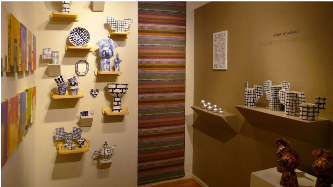
Exhibition view: Tell me something good by Alex Stadler.

The same can be said of his art and of the humans and animals (dogs, mostly) it often depicts, standing frontally with low centers of gravity, weight planted firmly on two (or four) parallel feet. Their faces are innocent, vulnerable, knowing, and somewhat sardonic all at once. Stadler writes: "For 40 years I have been trying to make objects that are elegant and also funny. So, in that way, it's about life every day, messy and falling short, with occasional moments of sweetness and beauty...." Stadler is showing and telling us something good.